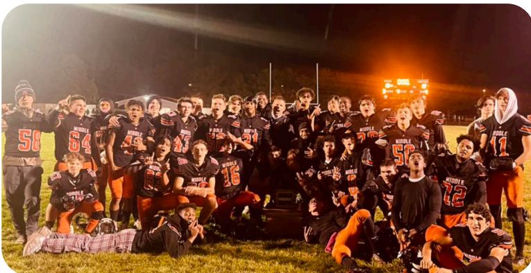
Middle Township High School Football team celebrating win over Lower Cape May Regional.

Middle Township's Anchor Bowl record now stands at 64-37-5 against Lower Township Regional.